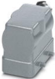
HEAVYCON B10 sleeve housing, for double locking latch, height: 56 mm, with 1 x Pg16 screw connection, lateral cable outlet

Please be informed that the data shown in this PDF Document is generated from our Online Catalog. Please find the complete data in the user's documentation. Our General Terms of Use for Downloads are valid ( http://download.phoenixcontact.com )