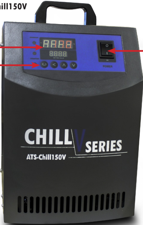
PID Controller (Proportional Integral Derivative Controller)