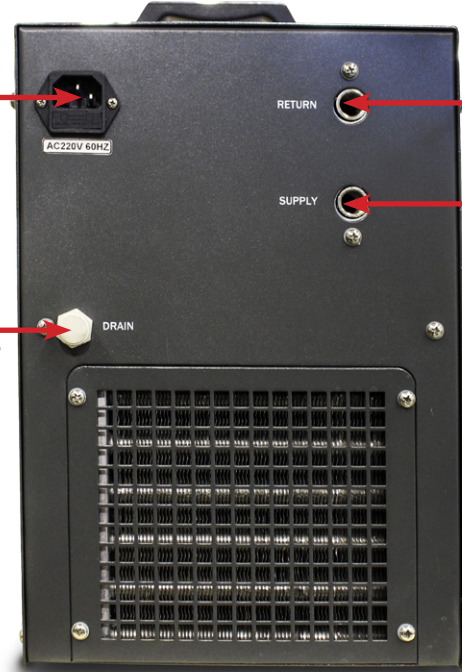
Power Supply Connection