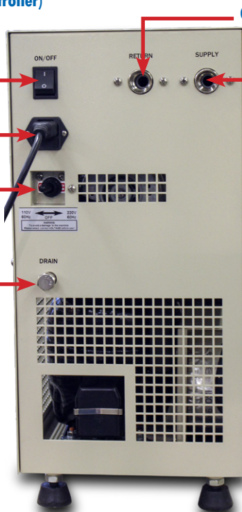
Quick Connect Fluid Input