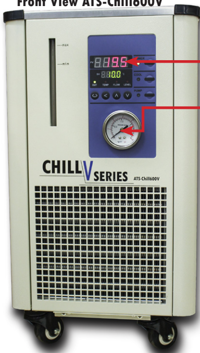
PID Controller (Proportional Integral Derivative Controller)