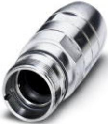
Sleeve housing for coupler connector, straight, Screw locking, M23, Shielded: Yes, Cable cross section: 10 mm...14 mm

Please be informed that the data shown in this PDF Document is generated from our Online Catalog. Please find the complete data in the user's documentation. Our General Terms of Use for Downloads are valid ( http://download.phoenixcontact.com )