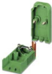
Cable housing, Pitch: 0 mm, Number of positions: 3, Dimension a: 24.66 mm, Color: green

Please be informed that the data shown in this PDF Document is generated from our Online Catalog. Please find the complete data in the user's documentation. Our General Terms of Use for Downloads are valid ( http://download.phoenixcontact.com )